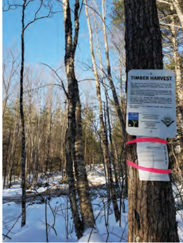
Middle: In winter 2021, a timber harvest was conducted on the Glavin Forest in Warner.