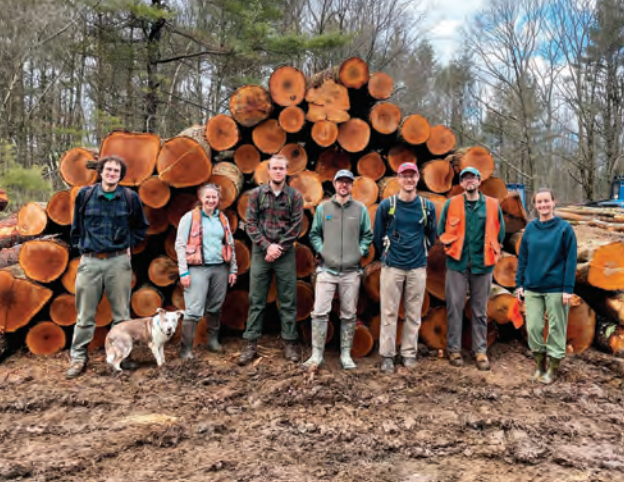
Left: Forest Society staff tour a harvest in Rindge.