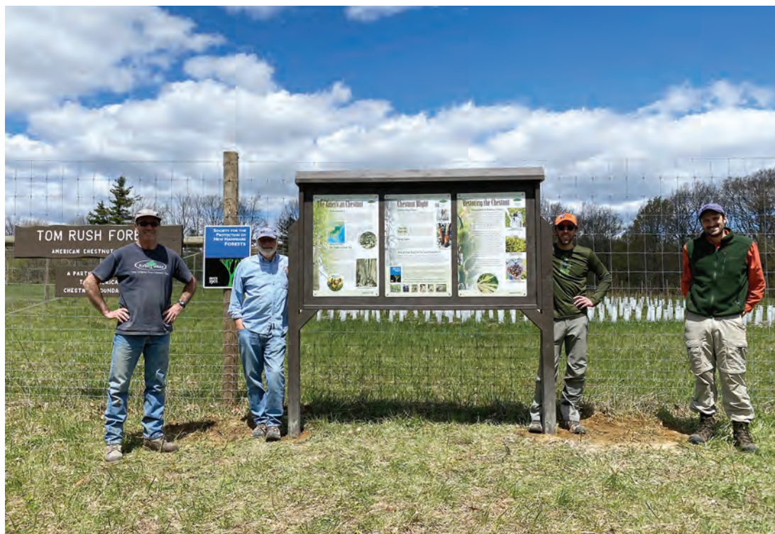
Forest Society staff and volunteers stand beside a new kiosk at the Tom Rush Forest in Deering.